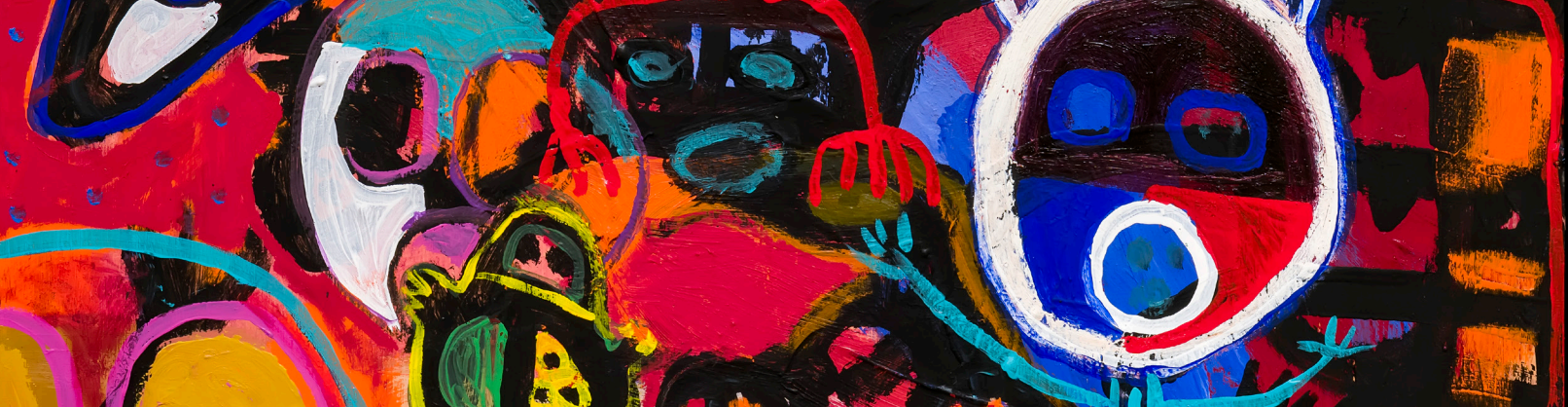
Jane Ash Poitras, Screaming Shaman series (detail), 1994, oil, mixed media. The Mendel Art Gallery Collection at Remai Modern. Purchased with support from the Canada Council's Acquisition Assistance Program, 1996.