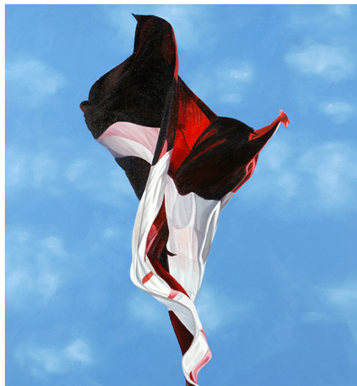
David Garneau, Canadian Flag/Flower , 2005, oil on canvas. Collection of the MacKenzie Art Gallery, purchased with the financial support of the Canada Council for the Arts Acquisition Assistance Program.

Please ensure you are in a space that includes a webcam and microphone. Program Guides at MacKenzie Art Gallery and Remai Modern will be able to virtually come to into your classroom and work directly with students. Basic materials needed are simple drawing materials including paper, pencils and markers.