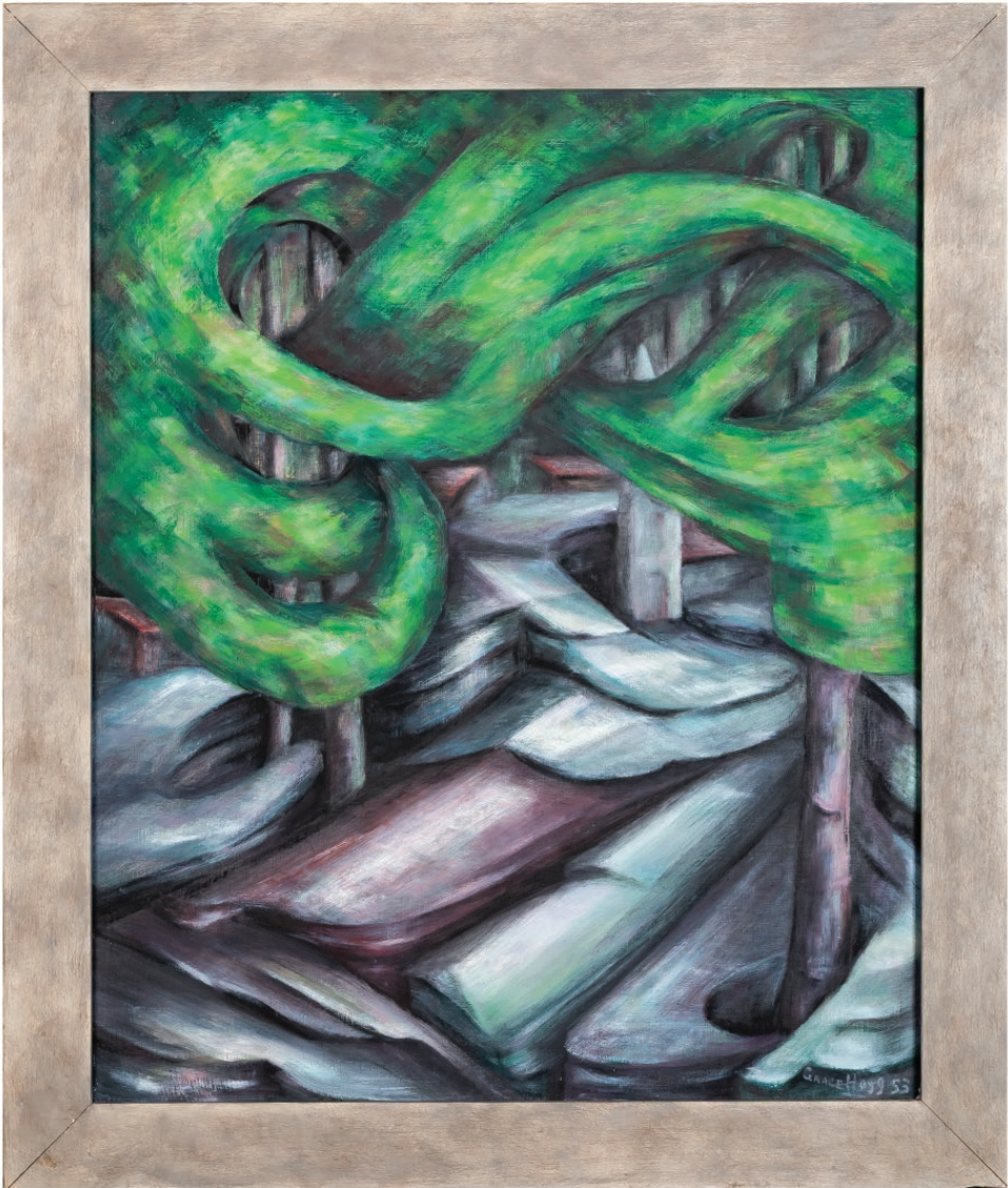
Above image: Grace Hogg, La Ronge , 1953, egg tempera, oil on Masonite panel, 73.6 x 60.8 cm. The Mendel Art Gallery Collection at Rемаi Modern. Purchased with funds raised by the Gallery Group 1988. © Grace Hogg.