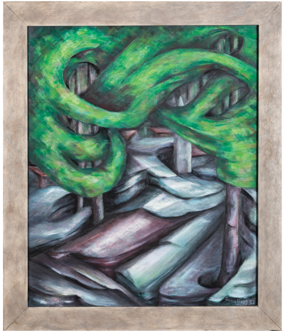
Above image: Grace Hogg, La Ronge , 1953, egg tempera, oil on Masonite panel, 73.6 x 60.8 cm. The Mendel Art Gallery Collection at Rемаi Modern. Purchased with funds raised by the Gallery Group 1988. © Grace Hogg.